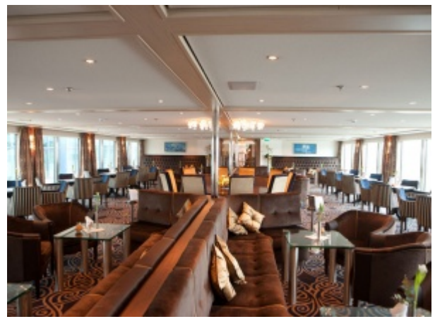
Salon / Lounge