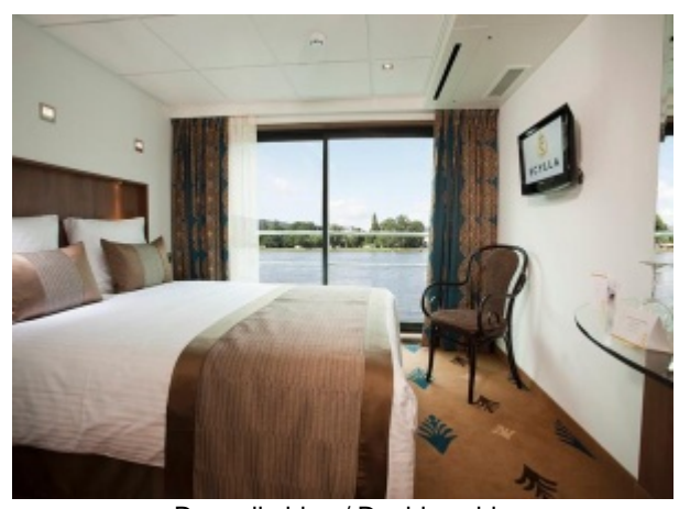
Doppelkabine / Double cabin